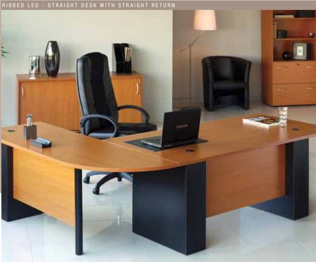
RIBBED LEG - STRAIGHT DESK WITH STRAIGHT RETURN

“The Direction Classic range offers a generous work space and is ideal to welcome visitors and work with all my colleagues. I chose a cherry finish to achieve a classical, highly elegant style.”