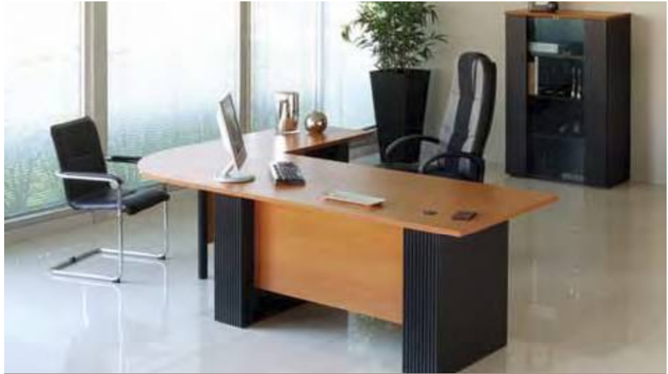
STRAIGHT DESK WITH RETURN - CABINET WITH 2 GLASS DOORS