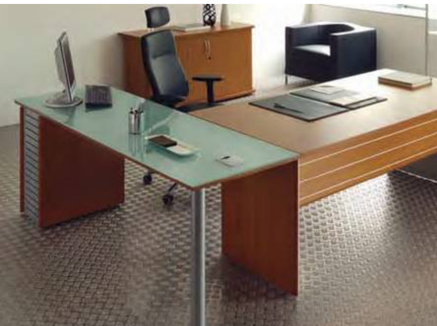
DESK + GLASS RETURN ON COMPUTER UNIT ②