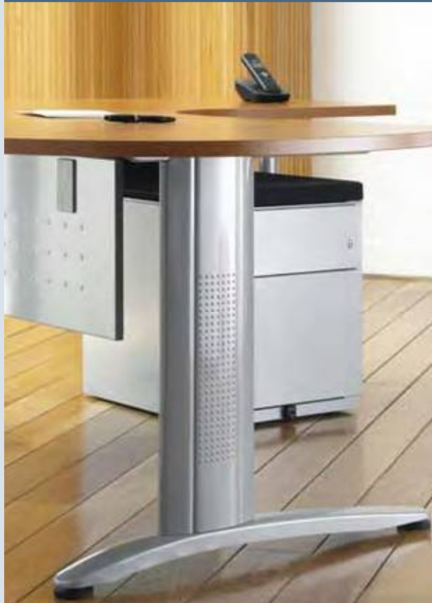
C LEG - RECEPTION COMPACT TOP

"We contacted an office distributor to reorganise our R&D departments. Our technical and environmental specifications were extremely precise. We chose Convisteel for its numerous combinations and its NF Environnement and NF Sécurité Confortique certifications."