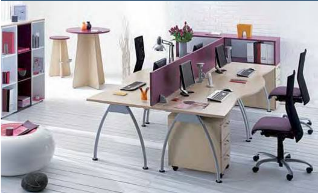
V LEG - WAVE TOP

" We chose Convisteel to equip two departments with different requirements. With its pure line, the V leg matches the style of our customer reception area perfectly.