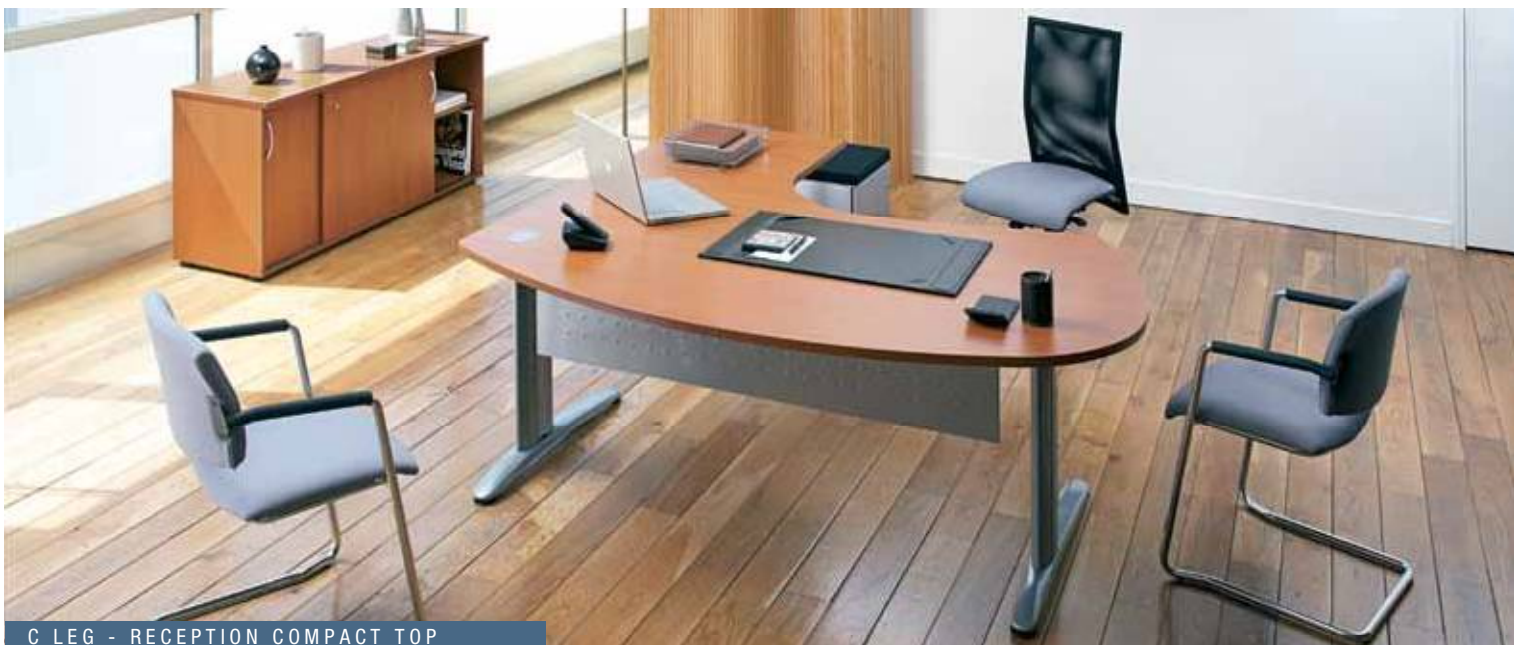
C LEG - RECEPTION COMPACT TOP