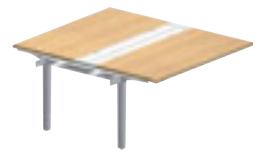
W.140 x D.165 cm