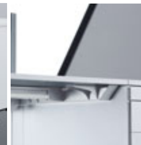
Link to connect pedestal/tops/beam