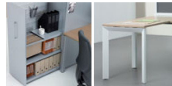
Tower pedestal: half pedestal, half cupboard