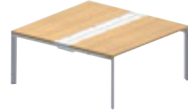
W.160 x D.165 cm