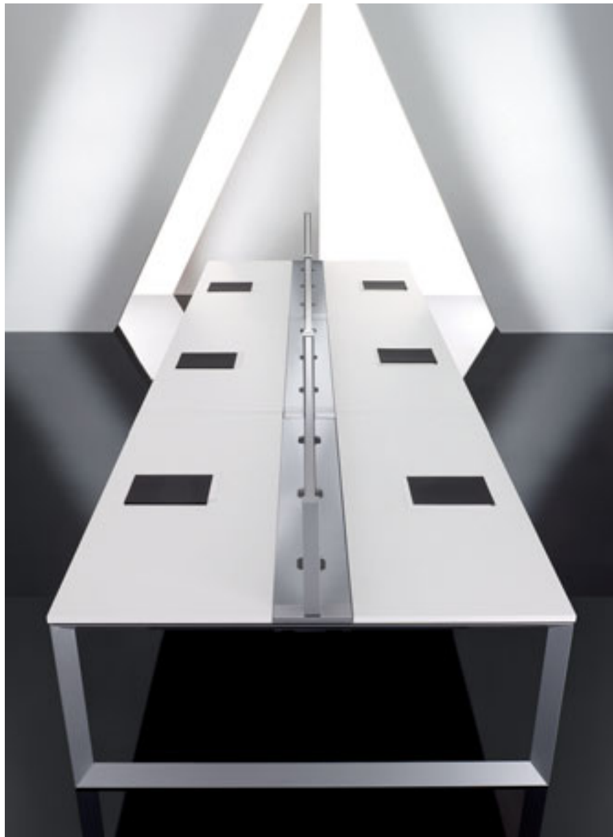
Extremely flexible linear configurations. Neat, well-ordered workstations make optimum use of space and are ideal for offices in which workers are constantly on the move.