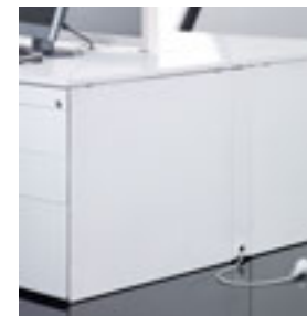
Cable storage kit with upper or lower port

The Bench System combines a range of flexible storage units with the potential to accessorize.