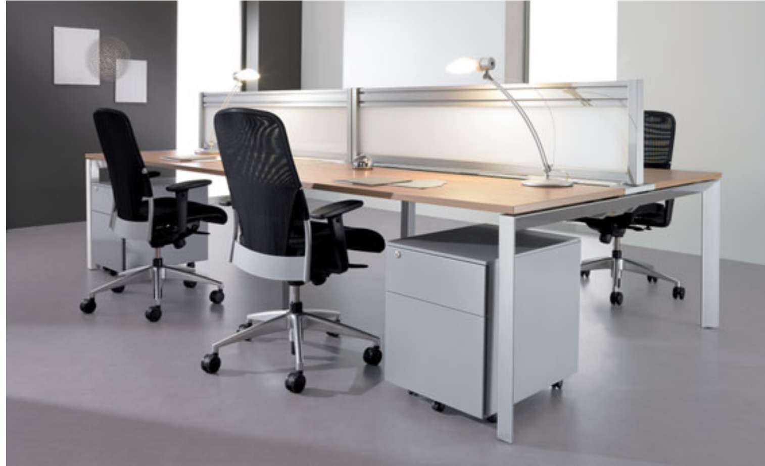
The bench system promotes and encourages teamwork, one of the key motivating factors in the modern office.